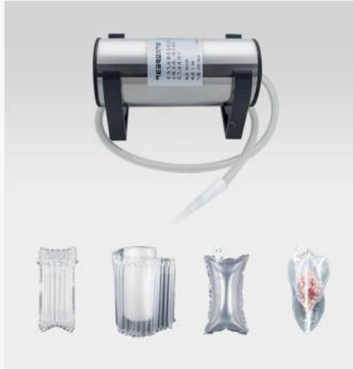
ELECTRIC AIR PUMP