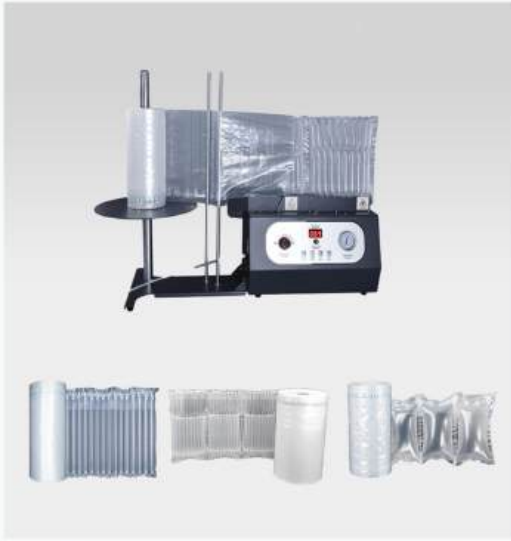
AIR COLUMN ROLL INFLATOR